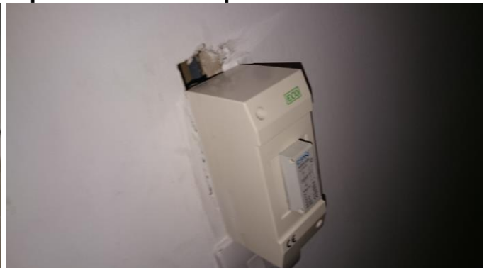
Repair damage to plaster