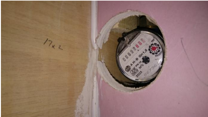
Example of fires topping required