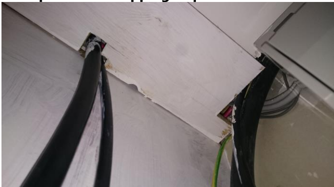
Fire stopping to ceiling