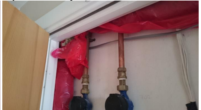
Replace insulation for plasterboard